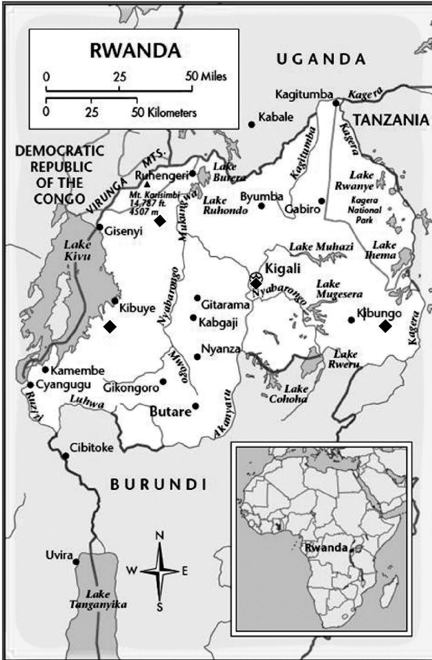
Map 1. Rwanda and the Locations of Land Registration Trials